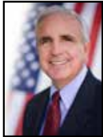
Mayor Carlos A. Gimenez

The Miami-Dade Beacon Council acknowledges the Miami-Dade Mayor and Board of County Commissioners for their continued commitment to and support of our economic development partnership for Miami-Dade County.