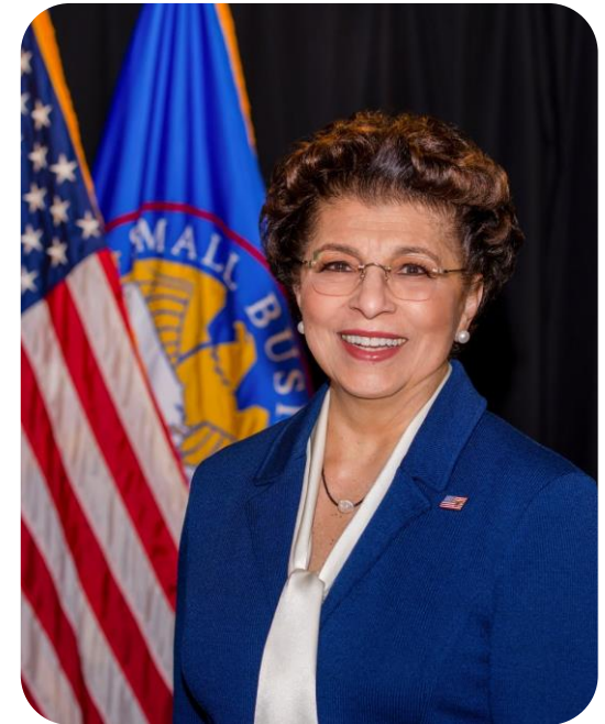
Administrator Jovita Carranza

Upon a request received from a state's or territory's Governor, SBA will issue under its own authority, as provide by the Coronavirus Preparedness and Response Supplement Appropriations Act that was recently signed by the President, an Economic Injury Disaster Loan declaration.